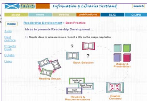
Readership Development image map, currently under development.

The homepage is currently receiving around 2500 page views per month.