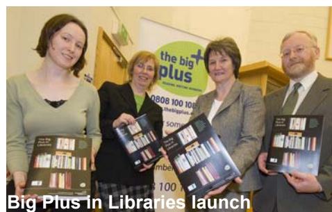
Big Plus in Libraries launch

SLIC launched The Big Plus in Libraries annual report on World Book Day 2007. The Big Plus in Libraries is a partnership initiative between Learning Connections, the learning arm of Communities Scotland, and SLIC. The initiative aims to promote adult literacy and numeracy opportunities and the report highlights the range of supporting services available in local libraries.