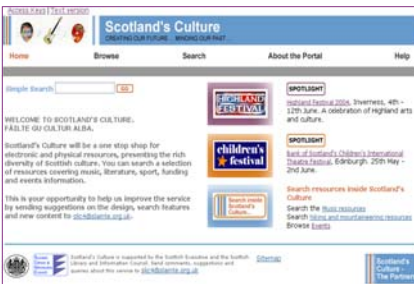
Regularly updated spotlights are added to the home page.